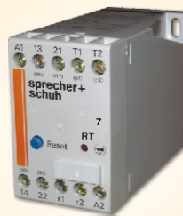
Thermistor Relay (RT7)