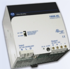
SMPS (1Amp to 40Amp) Switching Mode Power Supply