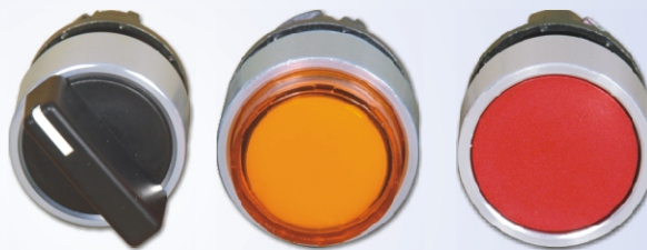
Switches, Indicating Lamps & Push Buttons