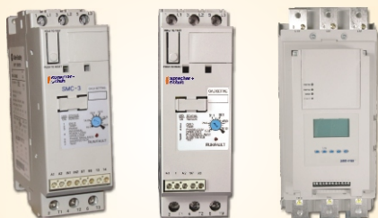
Soft Starters (1Amp to 1000Amp)